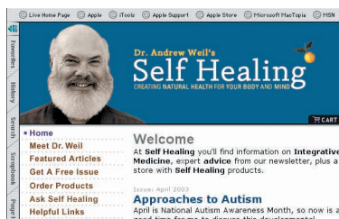
Dr. Andrew Weil

Internationally acclaimed neurologist and author