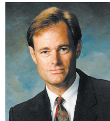
Dr. David Perlmutter, M.D.

"I am delighted to work with Nordic Naturals. The importance of high quality essential fatty acid supplementation for maintenance of cardiovascular health and brain function cannot be overstated. At the Perlmutter Health Center, we rely exclusively on omega oil supplements from Nordic Naturals as their products are unsurpassed for purity, potency and freshness."